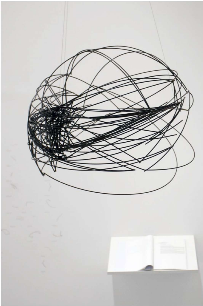
“Geometry of Space” (2008), stretched oxidised steel diameter sculpture, murals, chronologic drawings of 2008, Scams Atlas and publications (click to enlarge)

Later on, mapping out the visual culture of the post-war period, in which the Arabs as postcolonial subjects refuse to simply accept their fate as depoliticized and helpless, there are works from the 2014 exhibition I Must First Apologize , the result of research Hadjithomas and Joreige have undertaken since the 1990s into email scams and the way they reflect our modern world. The scams come from countries where online corruption is highly plausible (Russia, the Arab world, Africa), and the pieces interweave a general lack of trustworthiness in the public domain with recent political events from those regions: coups, revolutions, massacres. Geometry of Space (2014) is a series of sculptures tracing the itineraries of hundreds of emails presented in scam atlases. In “The Rumor of the World” (2014), non-professional actors read selected scam emails, addressing the viewer directly from multiple screens so that one has to come closer to hear, or else the words of these “rumors” fade into a sort of cosmic background in which it is impossible to hear what each speaker is trying to say.