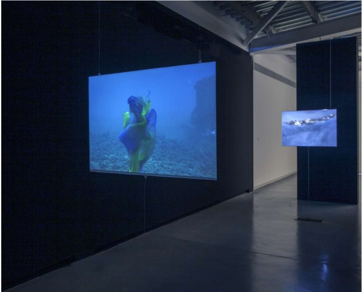
“Remember the Light” (2016), two-channel video, 8 minutes

How do we inhabit the abyss? The waters of the Mediterranean, once a glorious image of ancient civilizations, have become one of the most dangerous territories in the world for human life, for those fleeing endless dangers as the present dissolves in front of their eyes. It is impossible to look away from the facts: A breach has taken place in our long century so that we are trapped between an impossible past and uncertain future.